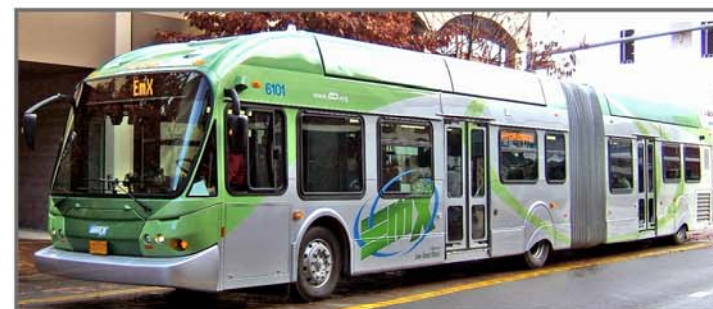
EmX BRT - Eugene, OR