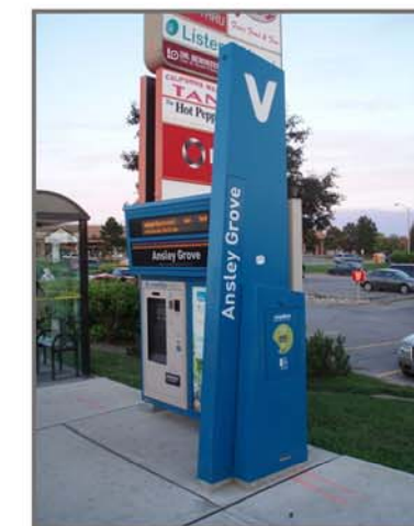
VIVA BRT - York, Ontario