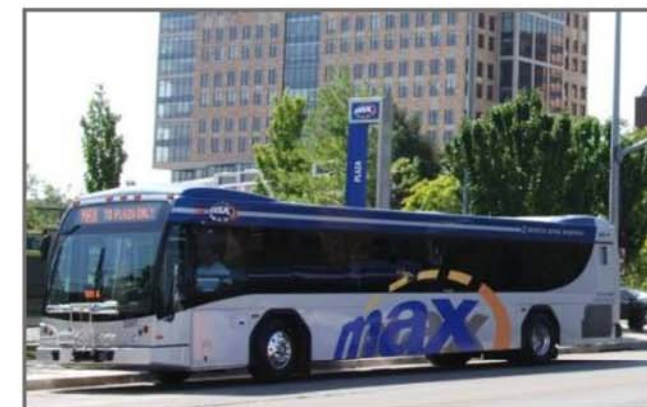
MAX BRT - Kansas City, MO