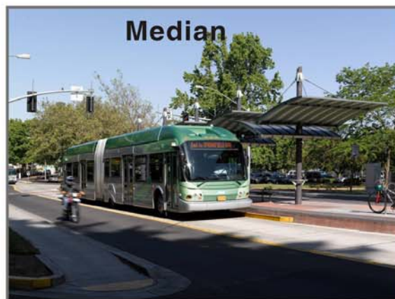
EmX BRT - Eugene, OR