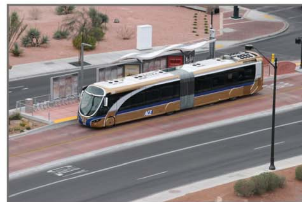
ACE BRT - Las Vegas, NV