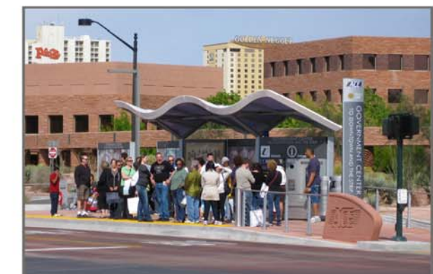
ACE BRT - Las Vegas, NV